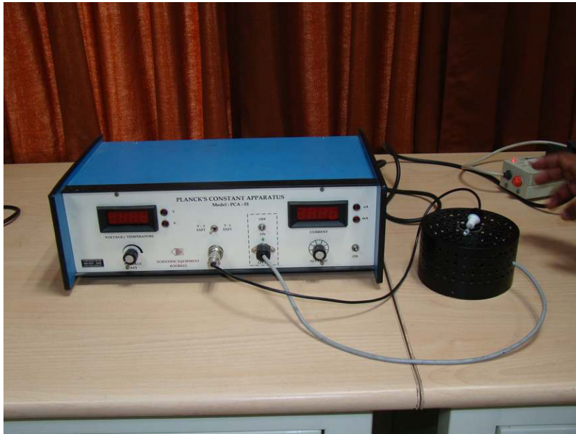
Figure 1: The experimental setup.