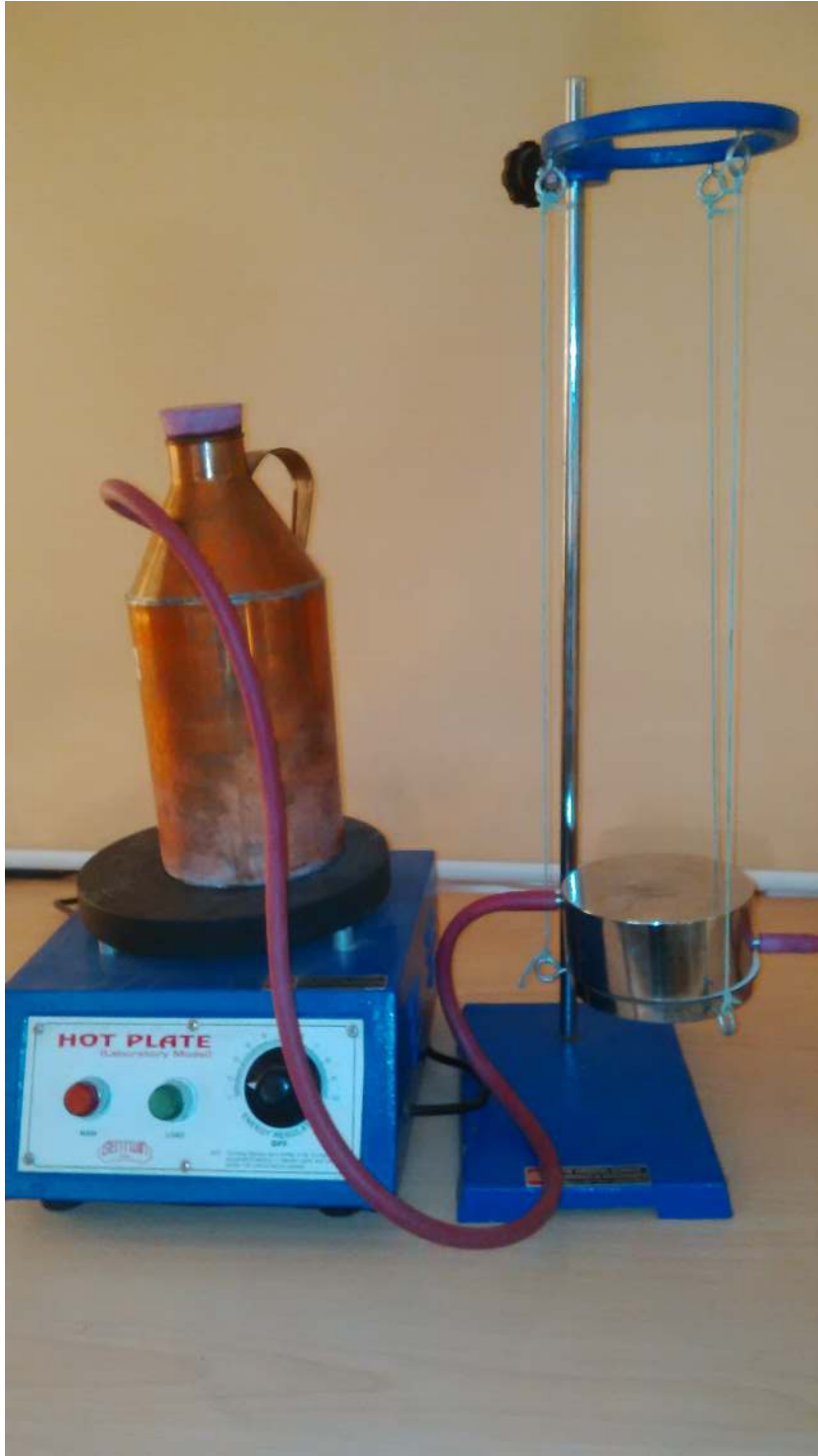
Figure 2: Schematic view of the Lee's disc apparatus.